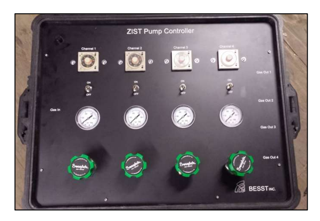
Figure 2- A 4-channel Timer Control Unit, used for nested or nearby wells