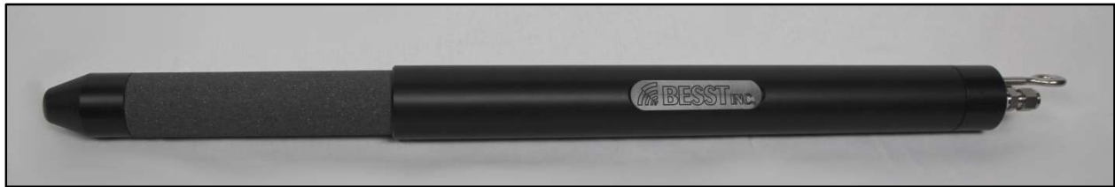
Figure 1 - Panacea P200 Pump with 200 mL chamber, economical Delrin plastic model with ceramic filter

BESST's line of Panacea Pumps are built out of rugged materials, designed for durability and consistency, and require little to no maintenance. The pump is powered by inert gas or air, meaning no more risk of malfunctioning from overheating motors. The two-valve lift system, when used in ratchet mode, does not allow the gas to contact the sample water, and enables gentle discharge of the sample, eliminating the need for fragile and unreliable bladders.